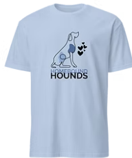
Foster 2 Dogs

Join our mission and let's change lives together!