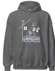
Foster 7 Dogs